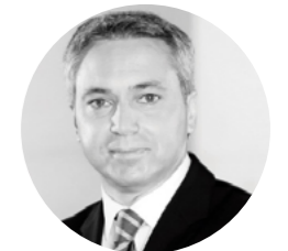
14 VICENTE VALLÉS